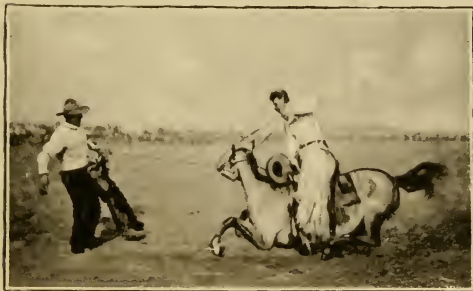
A FALLEN BUCKER.